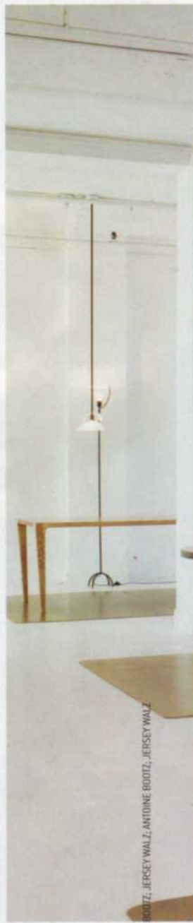
CLOCKWISE FROM TOP LEFT: ANTOINE BOITZ; JERSEY WALZ; ANTOINE BOITZ; JERSEY WALZ